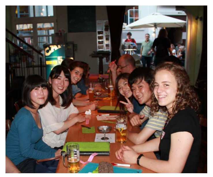
Enjoy our international get-togethers