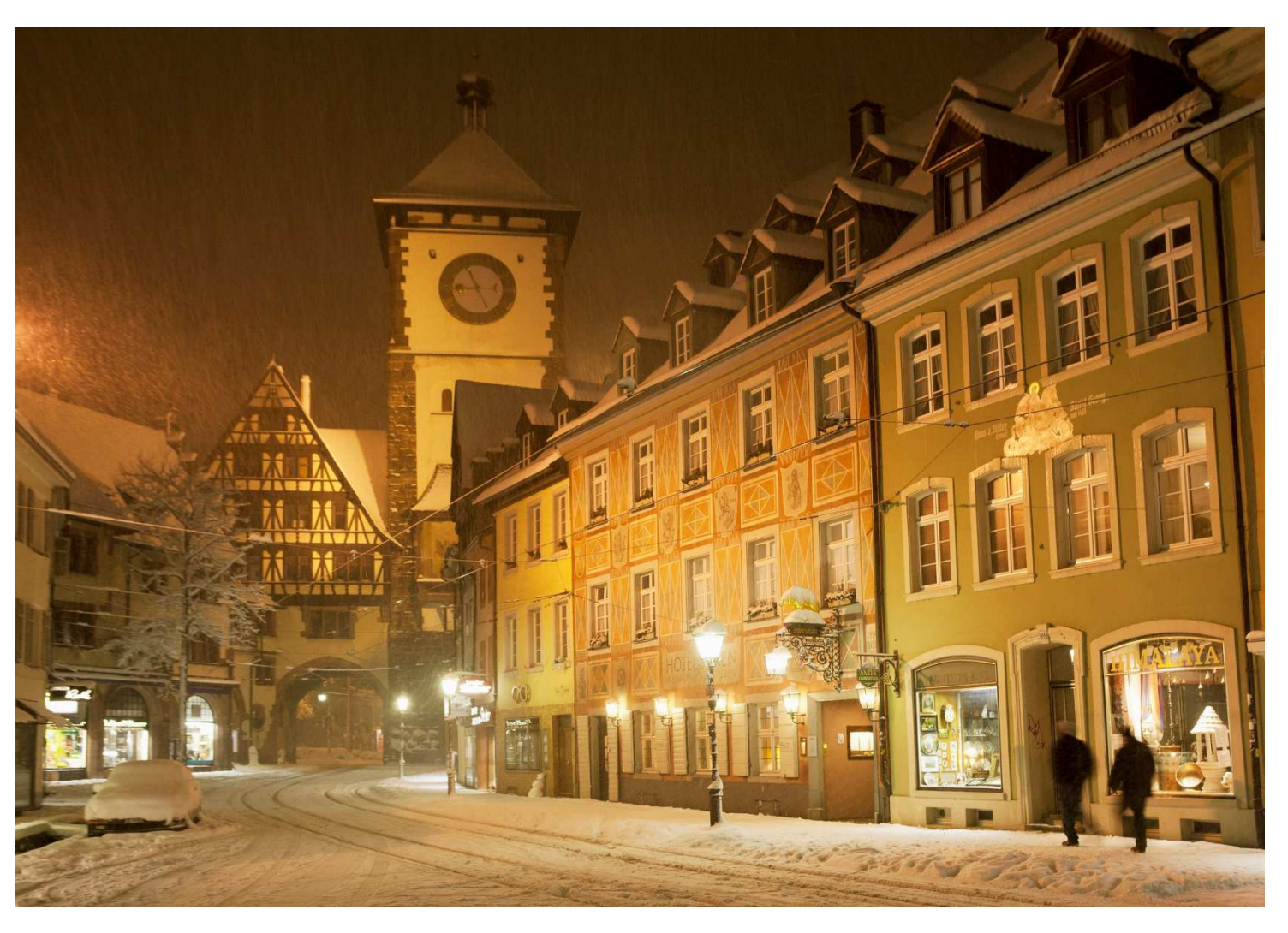
If you are lucky, there might even be snow...